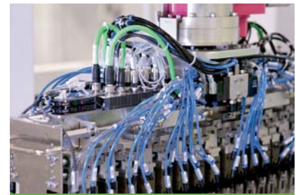
Sensors and actuators can be connected with the shortest possible cables

Thanks to specially designed modules, Cube67 is also excellently suited for the integration of smart IO-Link sensors. Up to 52 IO-Link devices can be connected to a single node – an impressive number compared to the competition! Murrelektronik makes installation even easier with a wide selection of accessories for IO-Link integration, including analog/IO-Link converters, inductive couplers, and hubs.