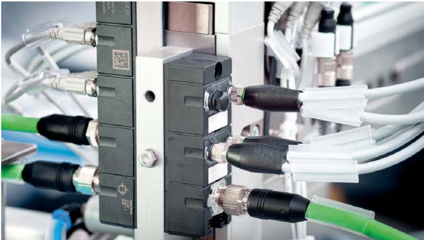
With the Cube67 field bus system, no port goes unused

The related hardware and software planning is carried out virtually based on a standardized full configuration. The components actually present in the real machine are activated automatically, making configuration for all the different parts of the machine a breeze. This simplification streamlines everything for the user. Optional additions can be configured easily with the press of a button. No need for time-consuming software modifications.