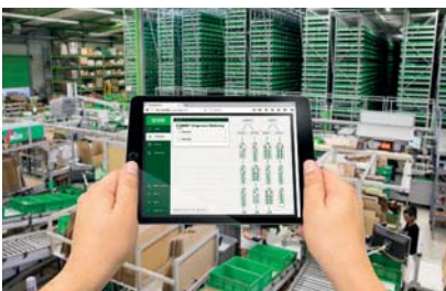
The network topology and any errors are clearly visualized in a user-friendly, multilingual web interface

The safety outputs of the MVK Metal Safety module will securely switch off up to 12 standard outputs, controlled by a ProfiNet/PROFIsafe control system (K3 functionality). They are divided between two safety circuits, each with